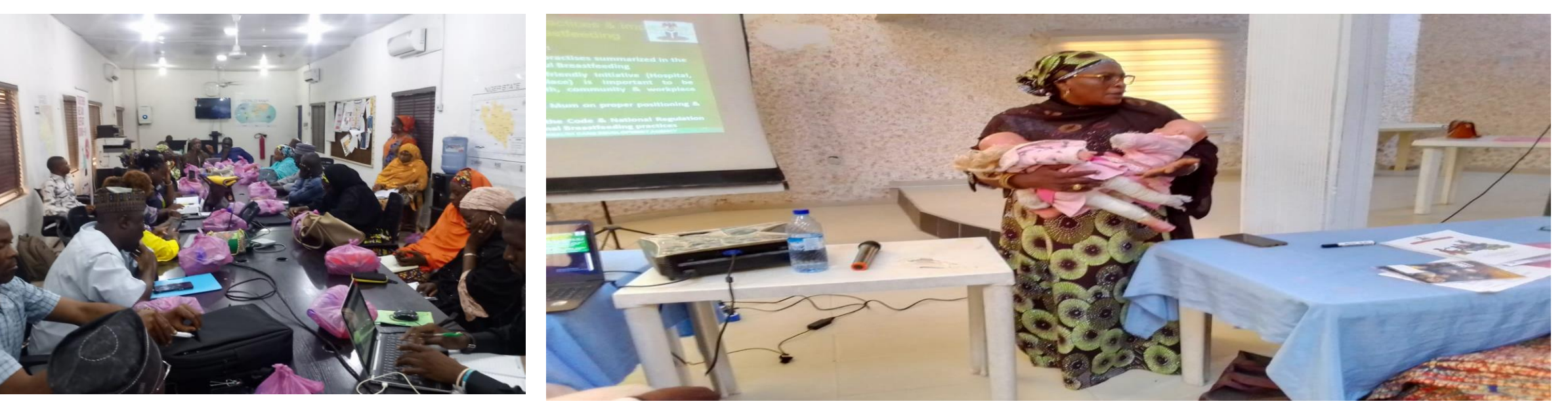
MIYCN Training of Health Care Workers in 10 LGAs of the Niger State