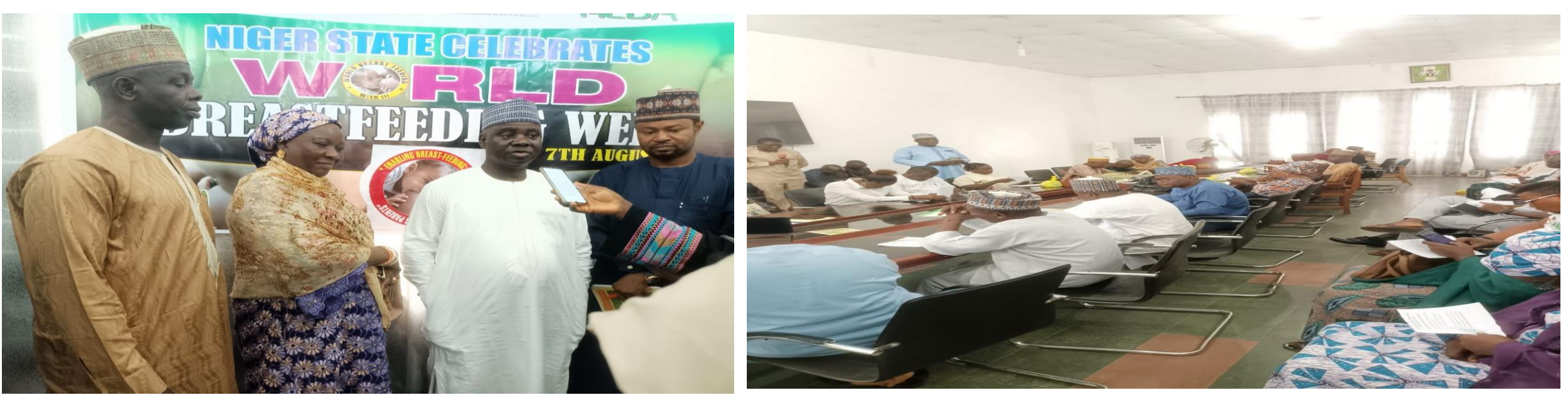
Press Briefing by the Perm. Sec. SMoH on the Importance of Marking World Breastfeeding Week 2023